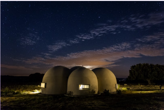
Night Shots by Carlos Criado.

For the nature-lovers, they are surrounded by an array of flora and fauna native to the area, and a countryside populated by holm oaks interspersed with huge granite rock formations. For the star-gazers, they sit under one of the clearest, most pollution-free skies in Spain, and so each Bujío includes a large capacity telescope with which guests can admire the wonders of the cosmos.